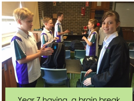
Year 7 having a brain break