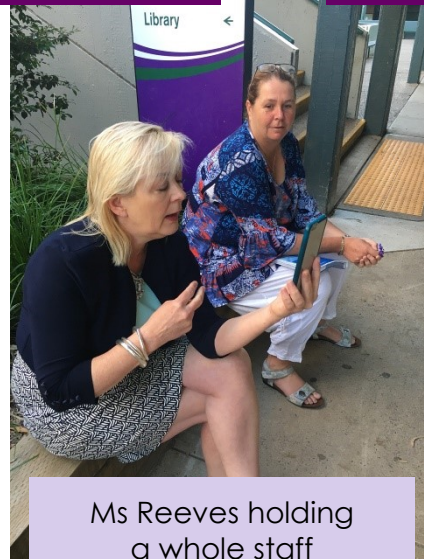
Ms Reeves holding a whole staff meeting remotely

There are many Brain Break activities online that a quick google search will reveal and incorporating these into your current home learning routines may be a good way of reenergising your child as they move through